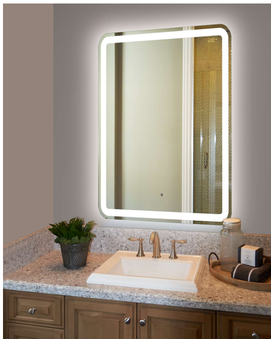
(Faucets and other display items not included)